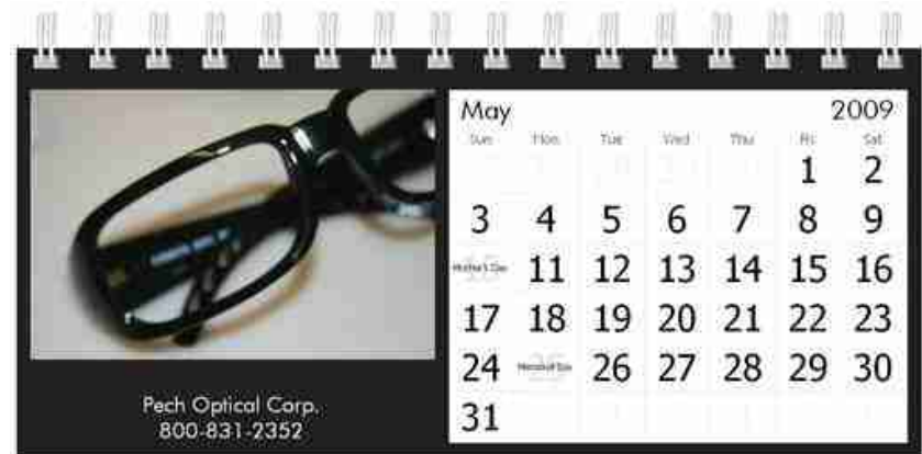
Pech Optical offers a wide variety of frame styles and manufacturers.