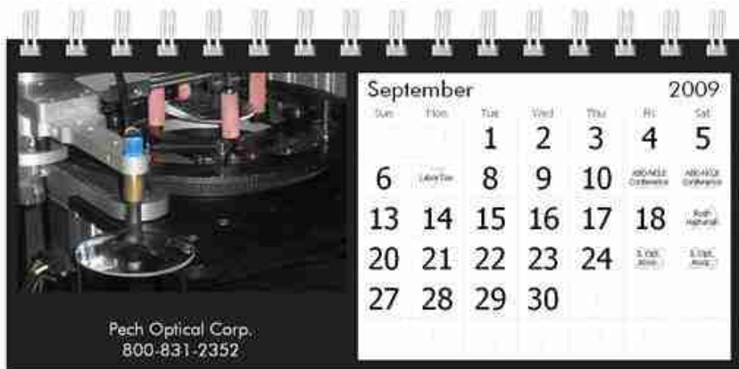
This robotic machine is used for Rx verification, checking thickness, and finish blocking.