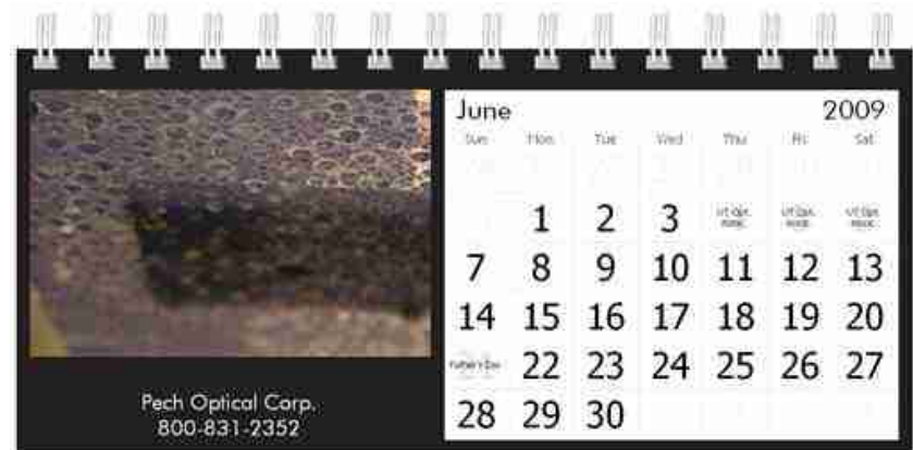
Condensation forms inside the anti-reflective prep chamber.