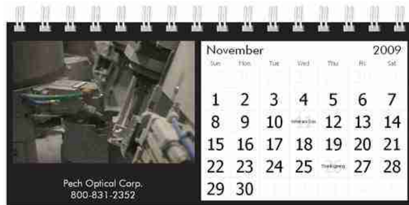
Dual head edging cuts two lenses at once for faster production.