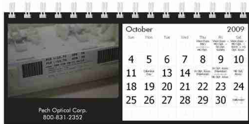
Each Rx is assigned a barcode for tracking the job as it goes through the lab.