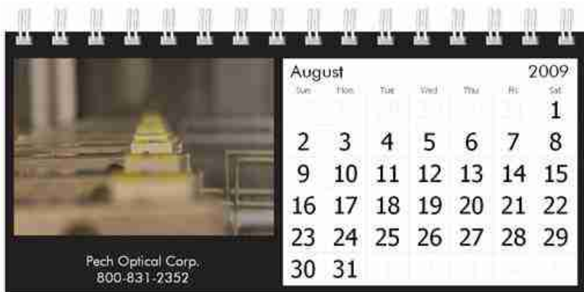
A series of levels are monitored as part of the anti-reflective coating process.