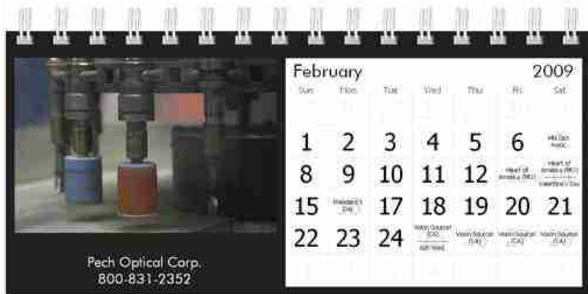
Specialized edger contains 18 tools for producing lenses with shelf bevels, inclined grooves, drilled holes, notches, or custom shapes.