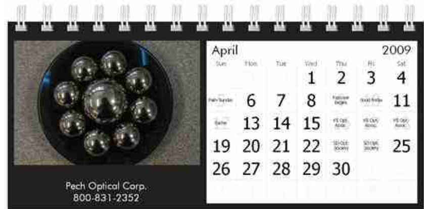
Drop balls are used to test the impact resistance of safety lenses.