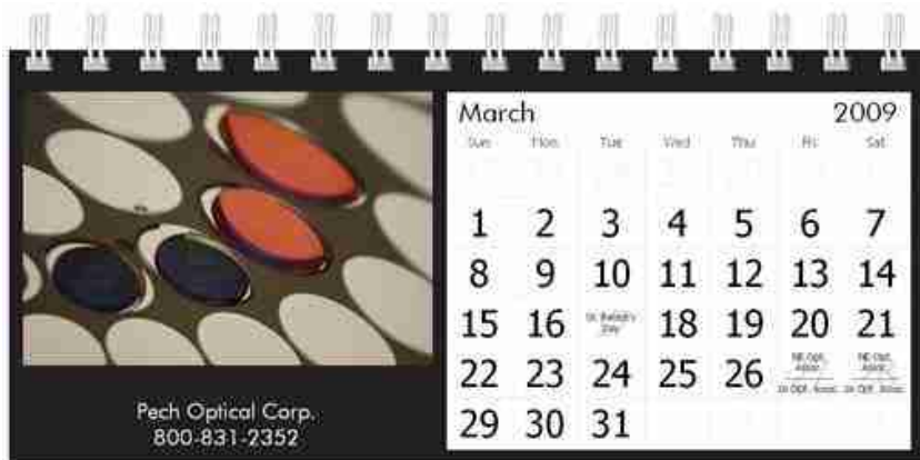
Pech Safari Mirror Coatings are available in 8 "wild" colors.