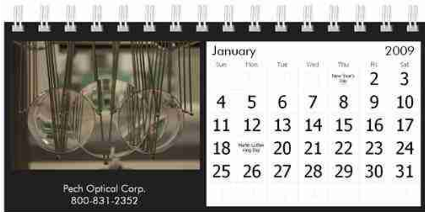
Lenses being prepped for anti-reflective coating.