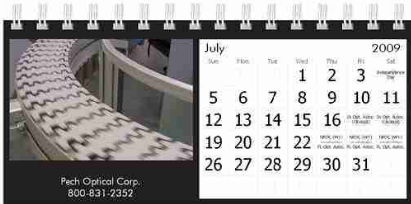
Conveyor belts carry trays throughout the lab.